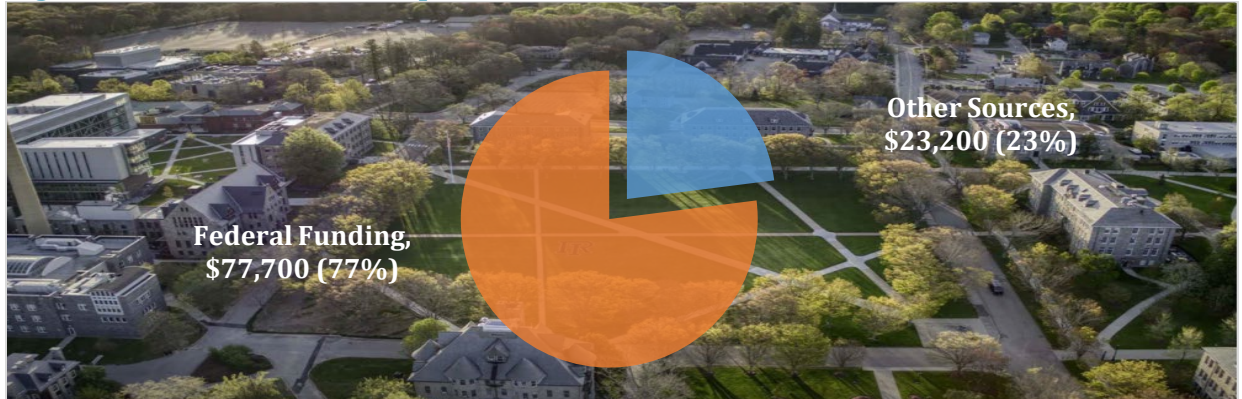
Figure 1: URI's FY 2019 Competitive Grants Portfolio

NSF OIG engaged Cotton & Company LLP (referred to as "we") to conduct a performance audit of costs incurred by the University of Rhode Island (URI) on four NSF EPSCoR program awards. URI is a public land grant research university located in Kingston, Rhode Island. In fiscal year (FY) 2019, URI reported approximately $100.9 million in competitive grants, with $77.7 million from federal sources, as noted in Figure 1.