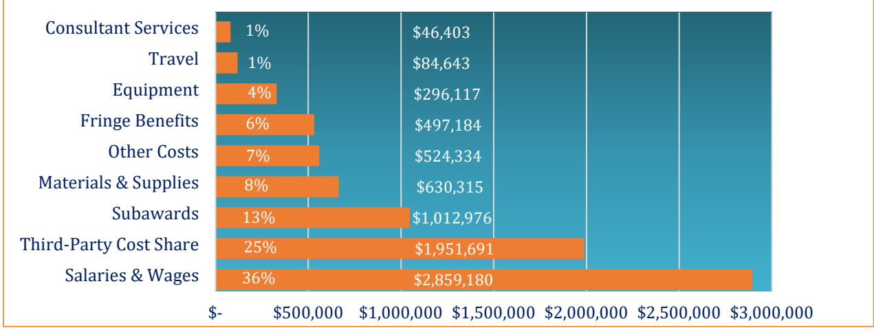
Figure 3: Cost Share Expenditures Reported by URI<sup>3</sup>

Source: Auditor analysis of accounting data provided by URI. *Other costs include publications and other direct costs.